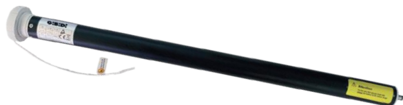
1 Radio electronic motor with on-board battery (duty-cycle 1600 manoeuvres)