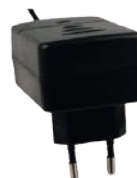
3 Battery charger